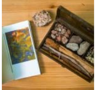
Linda McConaughy Non Site: Deer Isle