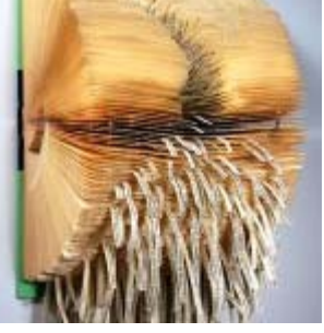
Elizabeth Ashcroft Chasm