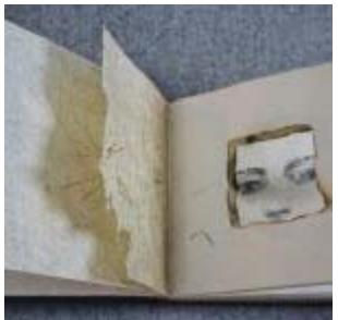
Birgit Otergaard Eyes Wide Shut