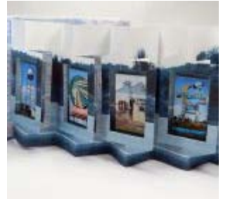
R Burton Blue Highway #22