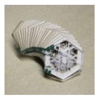
Islam Aly Sacred Meanings