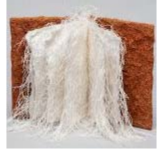
Debra Disman Burning Bush