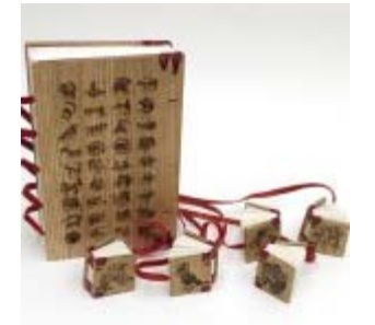
Islam Aly Fantastic Fauna