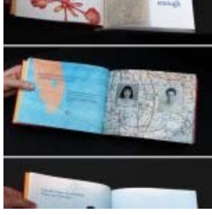
Myda lamiceli 50/50: Finding Myself Within Two Cultures